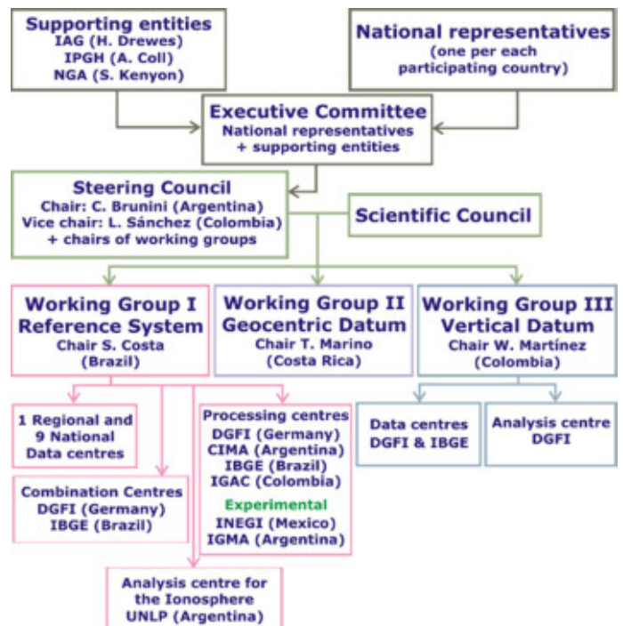
Fig. 1. Organizational Structure of SIRGAS.

The interaction between the administrative and scientific bodies is coordinated by the SIRGAS Steering Council, which also takes care of the administrative issues.